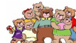
Bring the WHOLE family!