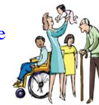
I praise you, for I am fearfully and wonderfully made. Psalm 139:14, NIV